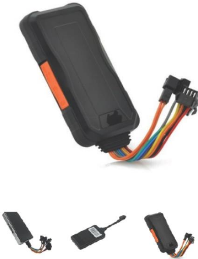
Reference Photos OF Vehicle Location Tracking System (VLT)